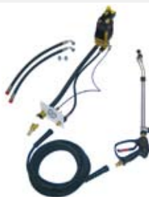
High pressure jet cleaner (140 bar)