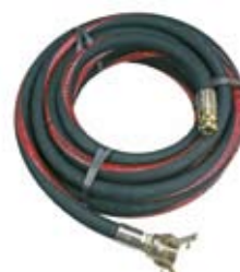
Ø 50 mm material hose with cam couplings