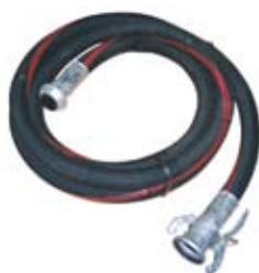
Ø 65 mm material hose with Perrot couplings