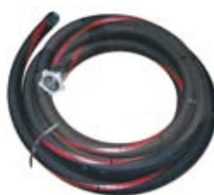
Ø 60 mm material hose with flow couplings