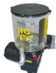
Automatic lubrication system