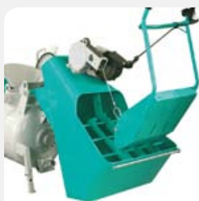
Cable and rope coilers with scraping shovel